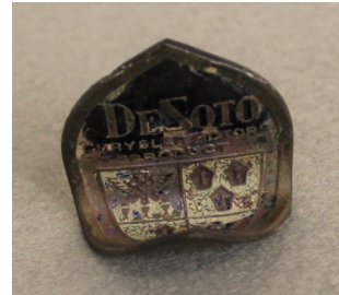
Most Unusual Arnie Steiner