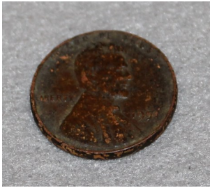
Best Coin Kevin Beane