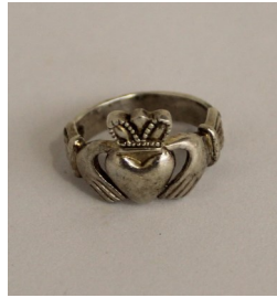
Best Silver Arnie Steiner